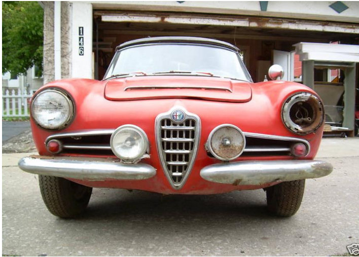
Figure 3. The missing headlight

conditions are determined by specifications? This example generated a lot of discussion regarding the identity criteria for an implementation of the automobile design. Can components be replaced within a unit without the identity of the unit changing?