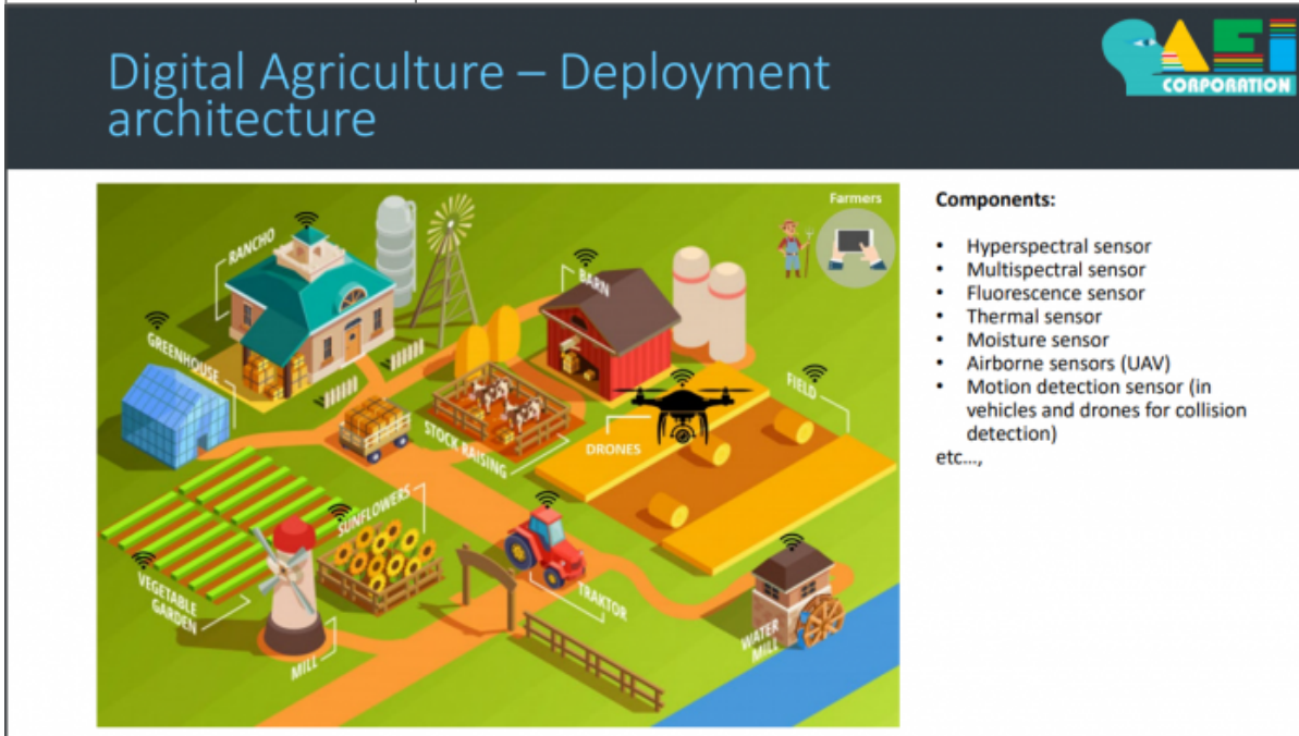
Figure 2: Small Representation of a Digital Farm.

Now you can imagine the number of sensors used for crop management and its not limited to this list. So here comes the complexity of configuring, controlling, and the maintenance of this bigger population of sensors in Digital Agriculture.