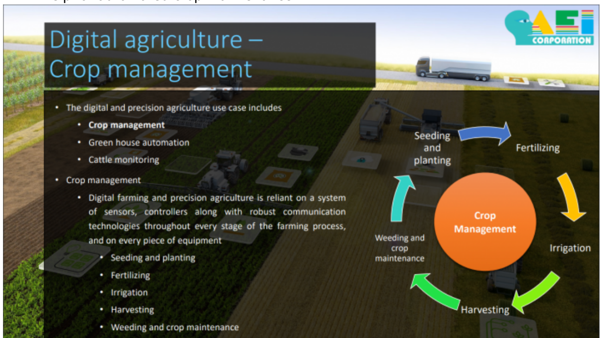
Figure 1: Crop Management Cycle

The various types of sensors, drives and distributed control systems drive the need for a connected network which can facilitate the exchange of data in real-time/non real-time. This data-centric distributed system needs to be precise, highly complex, dynamic, secure and robust.