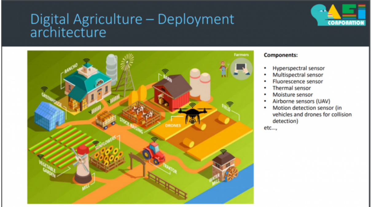
Figure 2: Small Representation of a Digital Farm.

Now you can imagine the number of sensors used for crop management and its not limited to this list. So here comes the complexity of configuring, controlling, and the maintenance of this bigger population of sensors in Digital Agriculture.