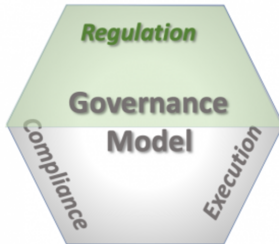
Figure 2: Regulation Aspect of Governance Model

A regulation as a legal term is a rule created by an administration or administrative agency or body that interprets the statutes setting out the agency's purpose and powers, or the circumstances of applying the statute. A regulation is a form of secondary legislation which is used to implement a primary piece of legislation appropriately, or to take account of particular circumstances or factors emerging during the gradual implementation of, or during the period of, a primary piece of legislation. 3)