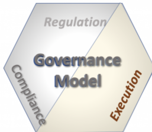
Figure 4: Execution Aspect of Governance Model

Execution is the aspect of governance charged with actually fulfilling formal, codified authoritative rules specified by regulation to those specifications provided by compliance. The responsibility for executing the regulation rarely, if ever, falls on the legislative body or those responsible for enforcing compliance with the regulation. Without execution, the other aspects of Governance are meaningless. Consequently, any discussion of governance must include the Execution Aspect.