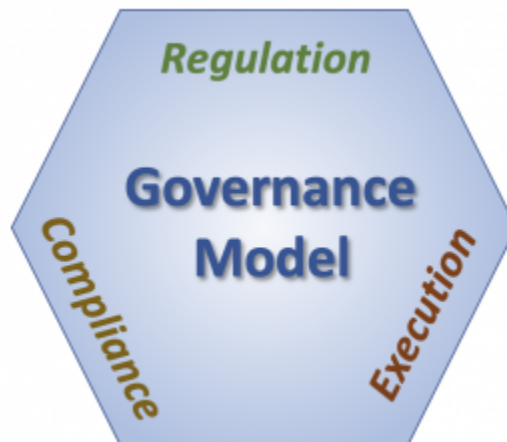
Figure 1: General Governance Model

The first aspect of governance conveys regulation, the second aspect conveys execution, and the third aspect conveys compliance, as represented in the following model.